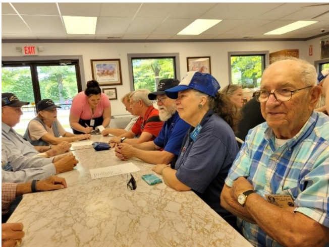
Ready to eat at Mike Linnig's restaurant