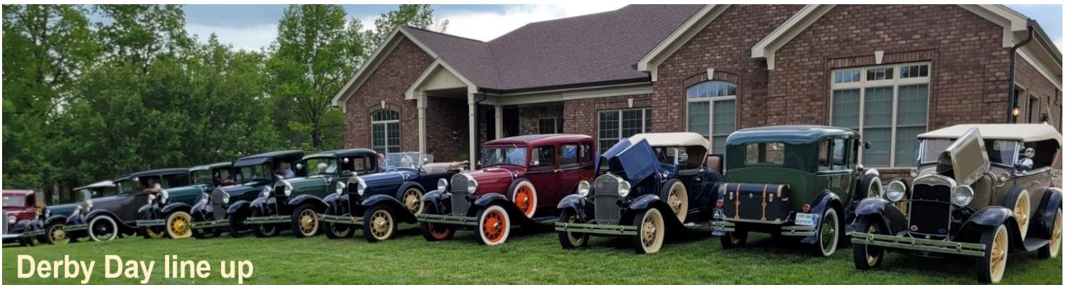
Derby Day line up

Your Name Badge is your ticket for Dinner.