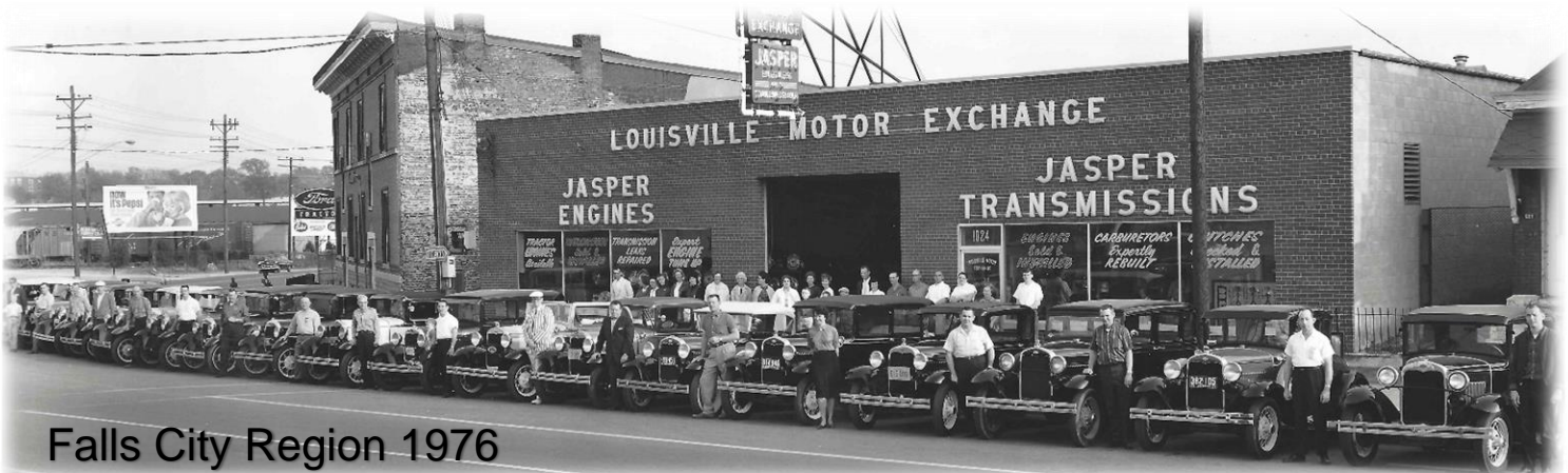
Falls City Region 1976