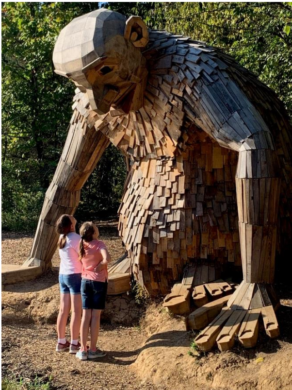
Watter's grandchildren checking out the Giant at Bernheim

7931 Windgate Drive Louisville, Kentucky 40291