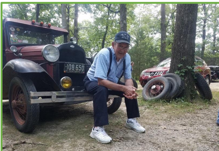
J.E. resting on a 31' pick up bumper