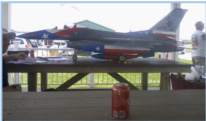
Remote-Controlled Jet Airplane

We had a good turnout at our annual Mothers & Father Day dinner in June with (32) members coming for the feed at the feed store! The food was delicious and there was plenty of it!