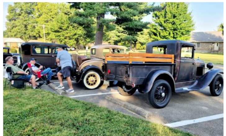
Falls City members at KYANA car's & coffee