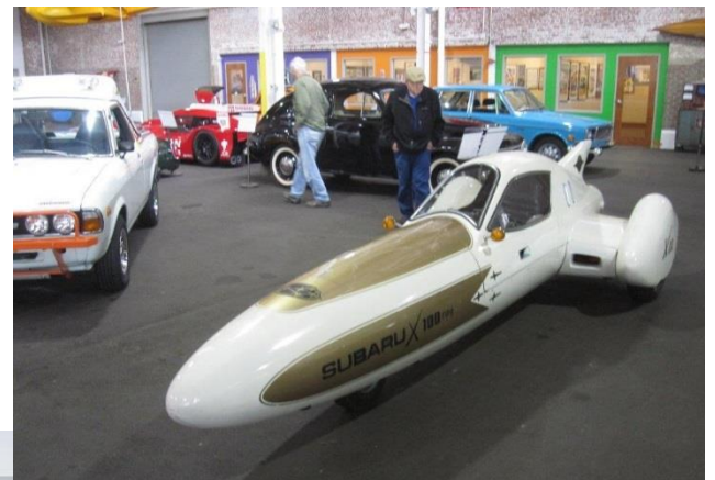
Cars in the Lane Museum