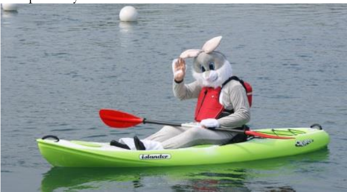
Easter Bunny making his way to the parade!