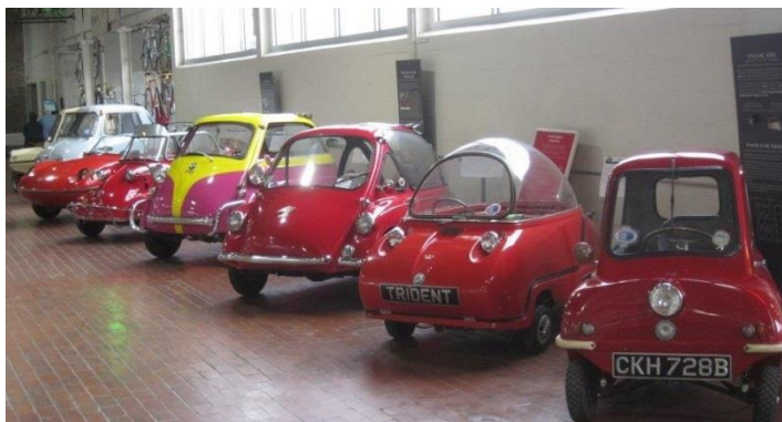
A few cars at the Lane Museum