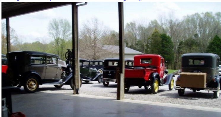
Model A's outside of Bill Stipe Machine Co. Inc

https://www.youtube.com/watch?v=p1adyD0I470