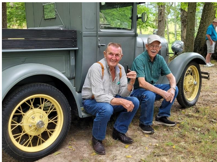
PERFECT USE OF A RUNNING BOARD