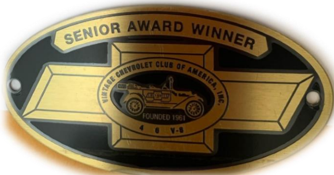
VCCA Senior Plaque

Emeric Howell showed how the original robe cord for a 4-door sedan is constructed with a steel cable covered in rope like material.