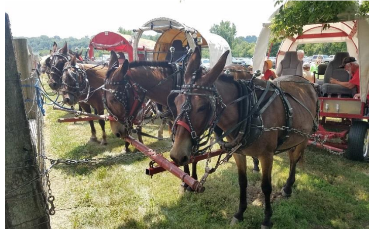
Mules chillin' at the Manton Music Jam