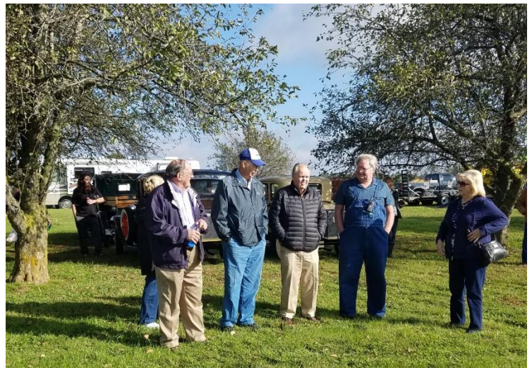
The Gang at Glendale