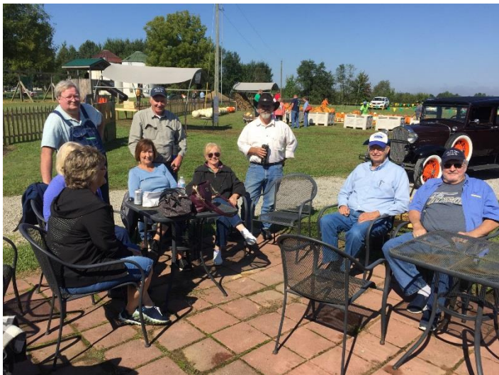
Relaxing at Hinton's